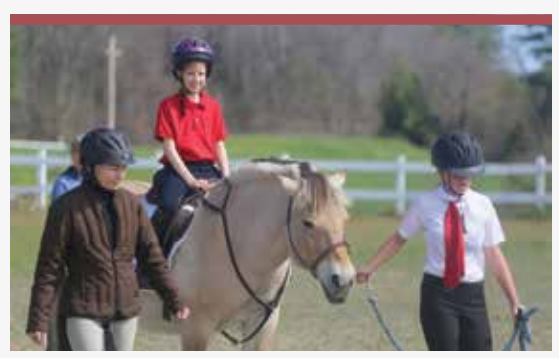
The Horsemanship Program