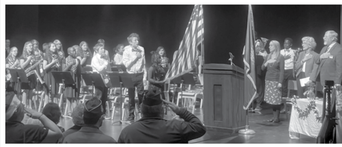
Saluting the Flag—Students and staff recite the Pledge of Allegiance together with local veterans and other special guests at the Veterans Day Observance held on November 10.

This holiday season began with trees donated by Christmas Trees of Vermont and decorating activities in the cottages and across the campus. The festive décor was a fitting backdrop for the Night of Giving. At this annual gathering, children from each cottage presented their projects and explained how they intend to give back to the community. Later, the Chester Rotary Club contacted the North Pole and arranged for Santa, Mrs. Claus, and helpers to visit each cottage. Then it was Holiday Visitors Day, which included a luncheon and musical performance. Afterwards, a select group of KHH singers participated in the Vermont Academy Candlelight Winter Concert, then traveled throughout the community singing songs of cheer. The season’s events culminated with an encore holiday concert performed by the children for their families.