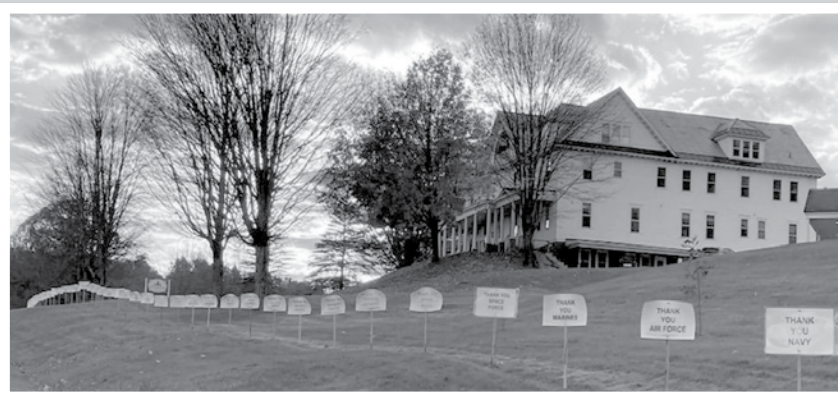
Signs of Gratitude—Veterans received a heroes’ welcome as they approached campus for the 2023 Veterans Day Observance event.